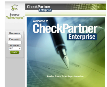
CheckPartner Enterprise Login