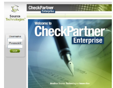
CheckPartner Enterprise Login